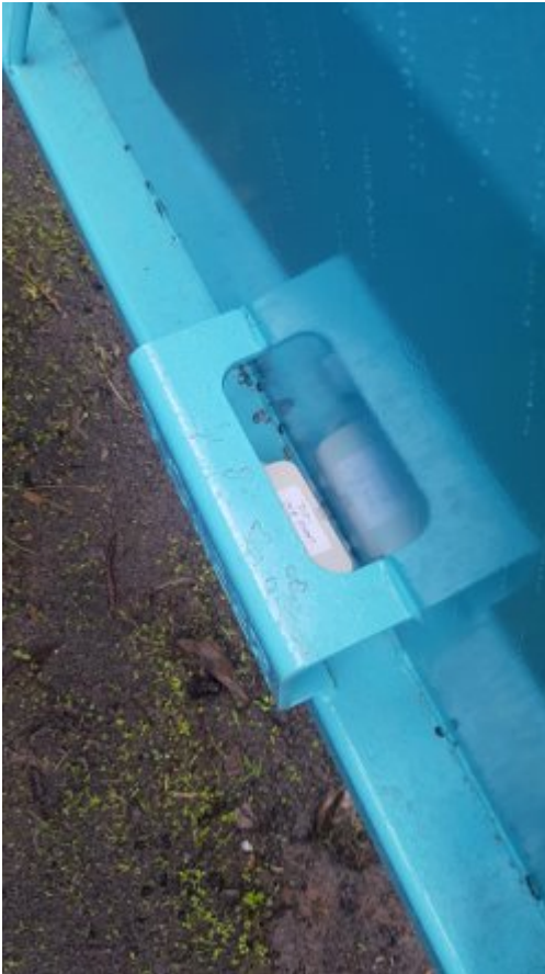
Metal Scrap Bins