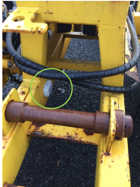
Line Maintenance Excavator Attachment